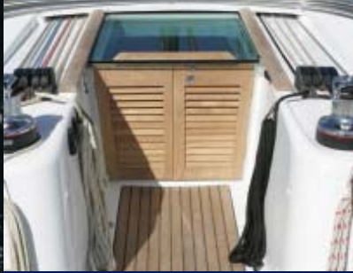
Hinged teak companionway door