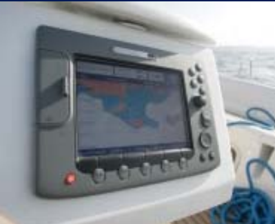
Optional Raymarine Color Chart Plotter