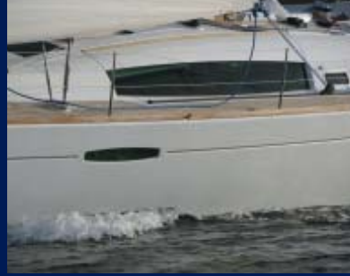
Large panoramic windows