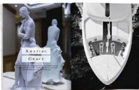
102 Graceful : a boat whose beauty belies her toughness