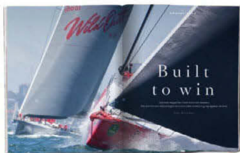
92 The fastest new supermaxi afloat hits the front...