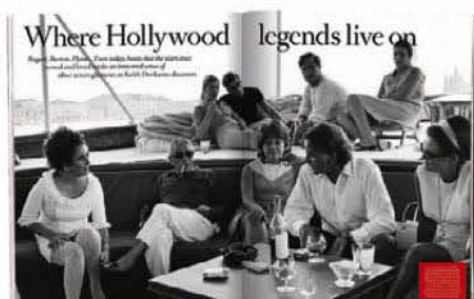
118 Forever glamorous – but where are the yachts now?