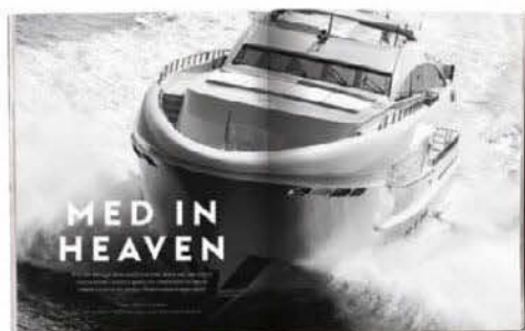
142 The motor yacht so nimble she can outrun storms