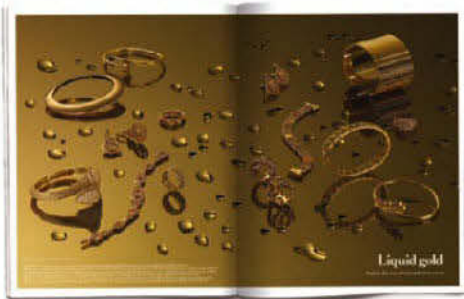
70 Gold jewellery is this season's buried treasure