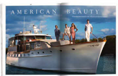
126 To complete this season's preppy look – just add a boat