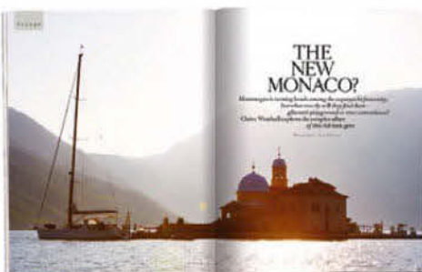
170 Montenegro: chic, luxurious and superyacht friendly